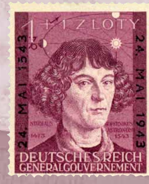
Stamp with Nicolaus Copernicus' image by Jeremiasz Falck, series "3rd anniversary of the creation of the Nazi General Governorate", 1943

Stamp with Nicolaus Copernicus' portrait modelled on the original from Toruń, series "150th anniversary of the creation of the National Education Commission and 450th anniversary of the birth of Nicolaus Copernicus", 1923