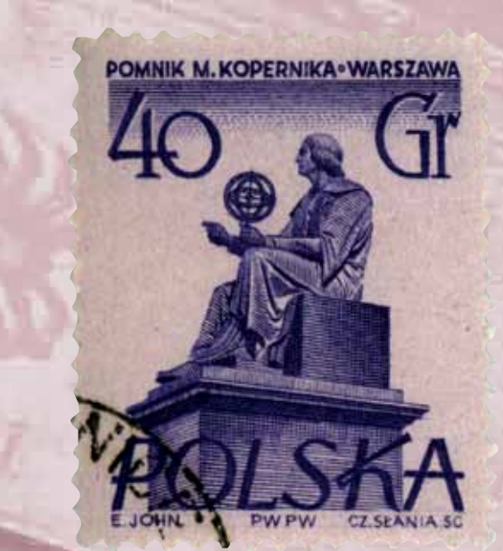
Stamp with Nicolaus Copernicus monument by Bertel Thorvaldsen in front of the Staszic Palace in Warsaw, series "Monuments of Warsaw", 1955