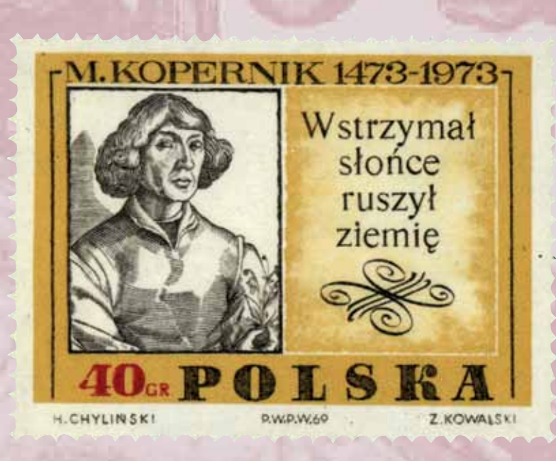
Stamp with Nicolaus Copernicus' portrait modelled on a wood engraving by Tobias Stimmer, series "500th anniversary of the birth of Nicolaus Copernicus", 1969