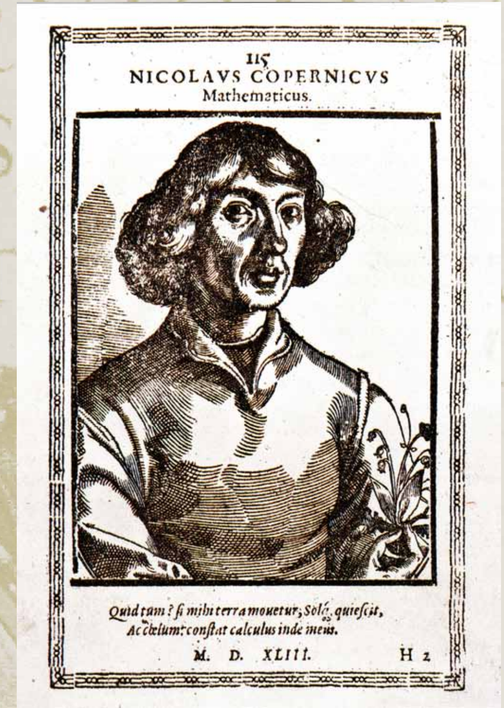
Tobias Stimmer, Portrait of Nicolaus Copernicus , 1587; the oldest graphic image of Nicolaus Copernicus; it is suspected it might have been created on the basis of Copernicus' self-portrait published in the work of Nicolaus Reusner Icones sive imagines virorum literis illustrium