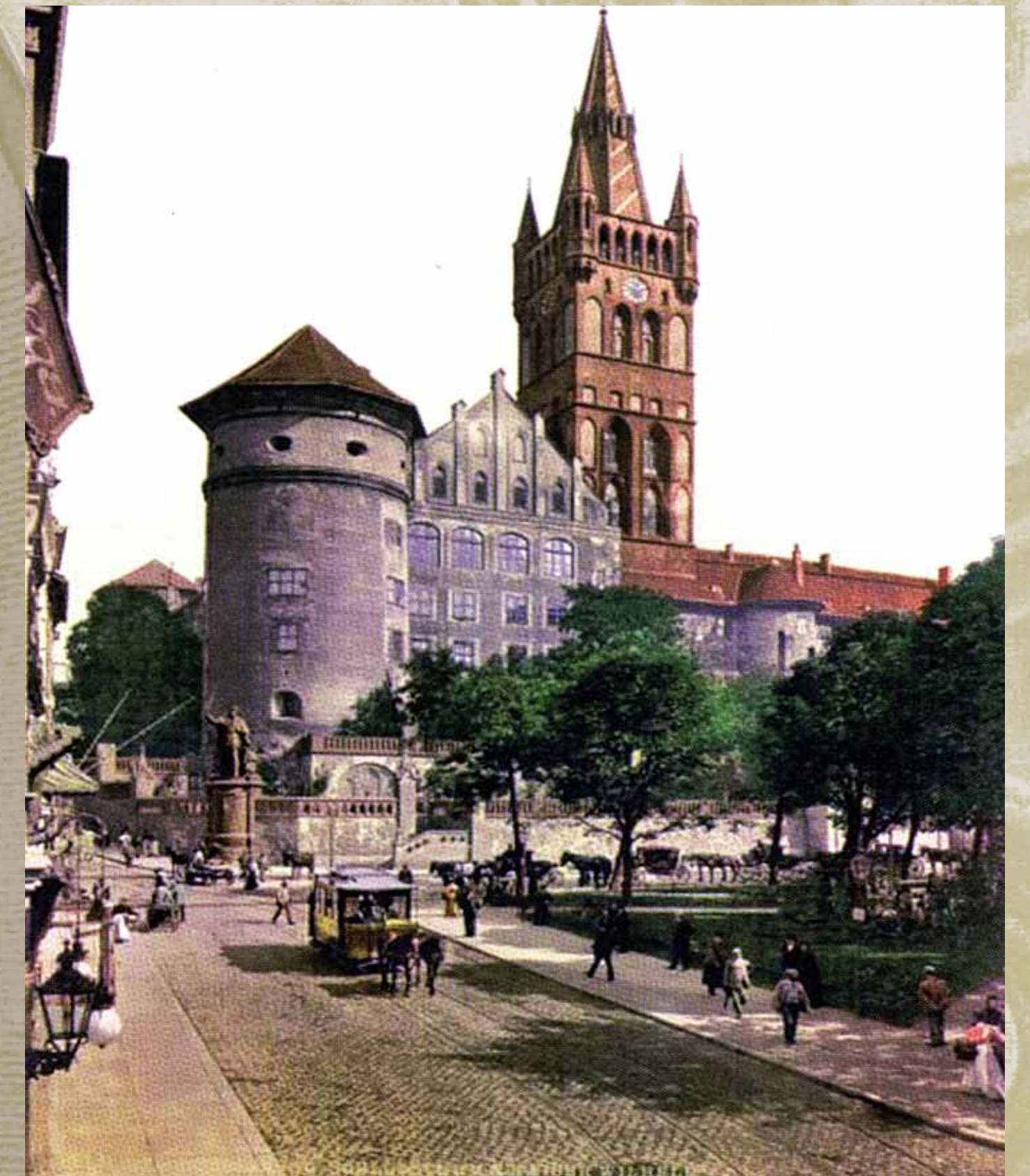
Teutonic Knights' castle in Kaliningrad; Nicolaus Copernicus conducted negotiations here with Albrecht Hohenzollern, Grand Master of the Teutonic Order; Copernicus was the leading figure in the war against the Teutonic Knights in western Prussia

In 1520, already as the commissioner of Warmia, he was delegated by the chapter to negotiate with Albrecht Hohenzollern, Grand Master of the Teutonic Order. In his letter to king Sigismund I the Old he wrote that he "would act as befitted noble and honourable citizens faithful to the king, and was even prepared to die for the cause".