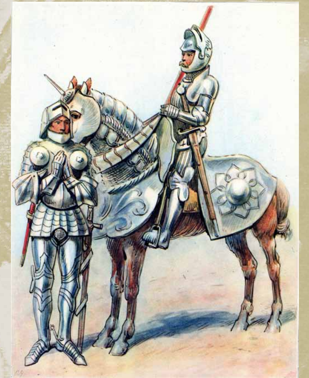
Polish knights, 15th–16th century