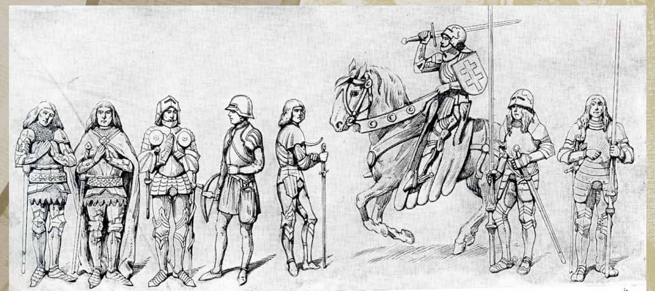
Polish knights, 1350–1500