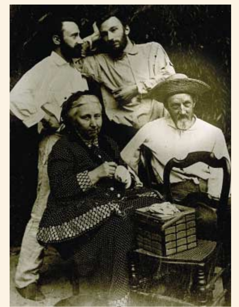
Eugene Curie father