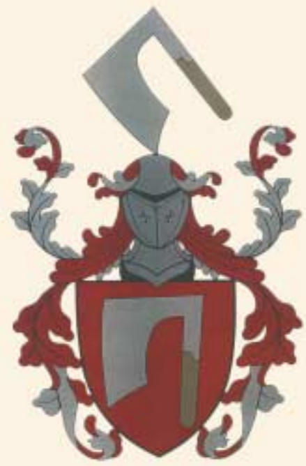
Topór coat of arms