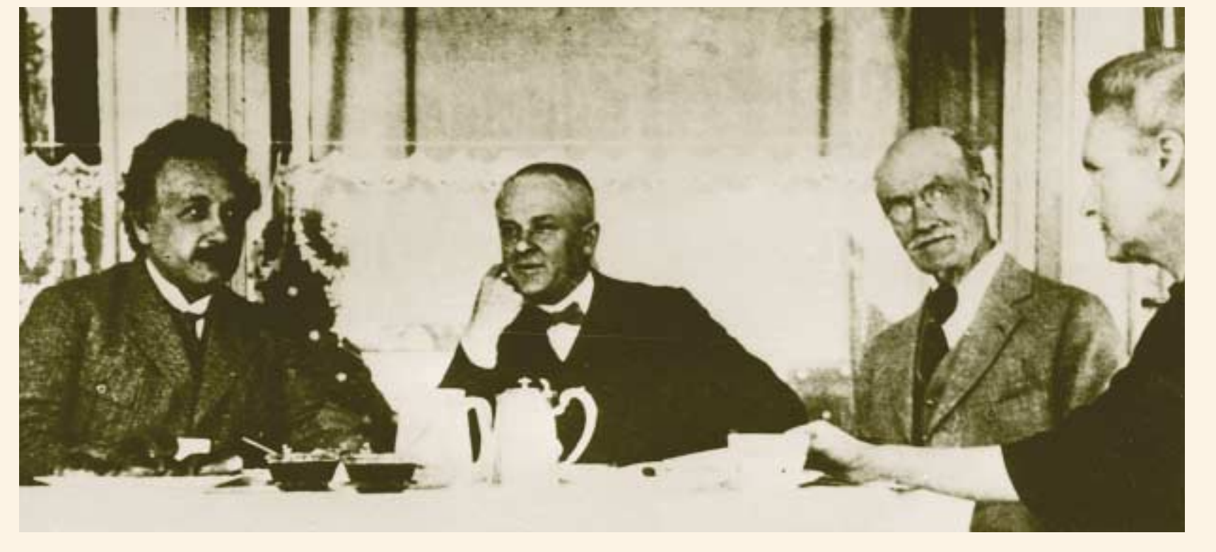
The Future of Culture Conference, Madrid, 1914