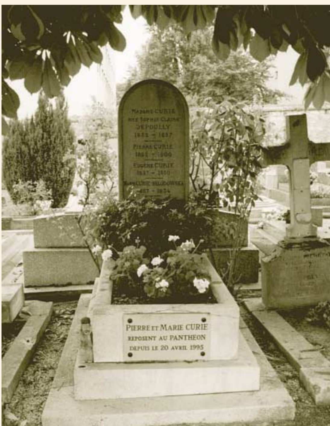
Family grave of the Curie family in Sceaux near Paris. Here Maria was buried on July 6, 1934

„Mme Pierre Curie died at Sancellemoz on July 4, 1934. The disease was an aplastic pernicious anaemia of rapid, feverish development. The bone marrow did not react, probably because it had been injured by a long accumulation of radiation.”