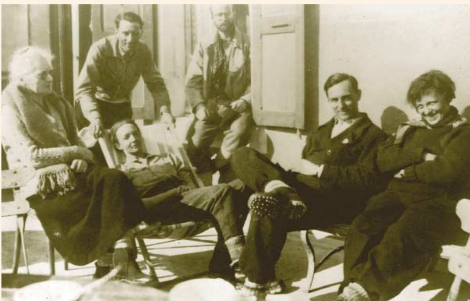
One of the last pictures of Maria Skłodowska-Curie with the family and friends