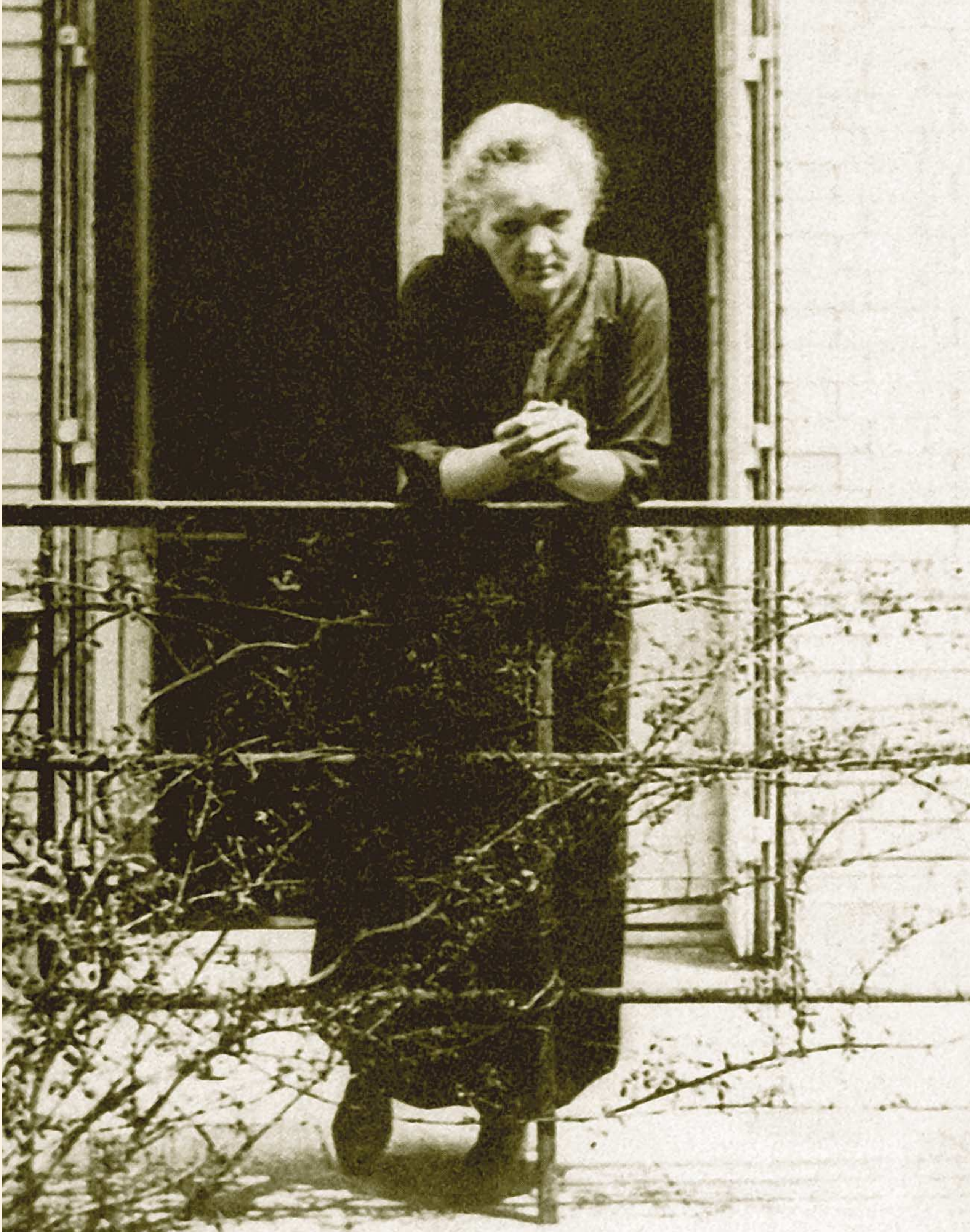
One of the last pictures of Maria Skłodowska-Curie, on the balcony of the Radium Institute, 1934