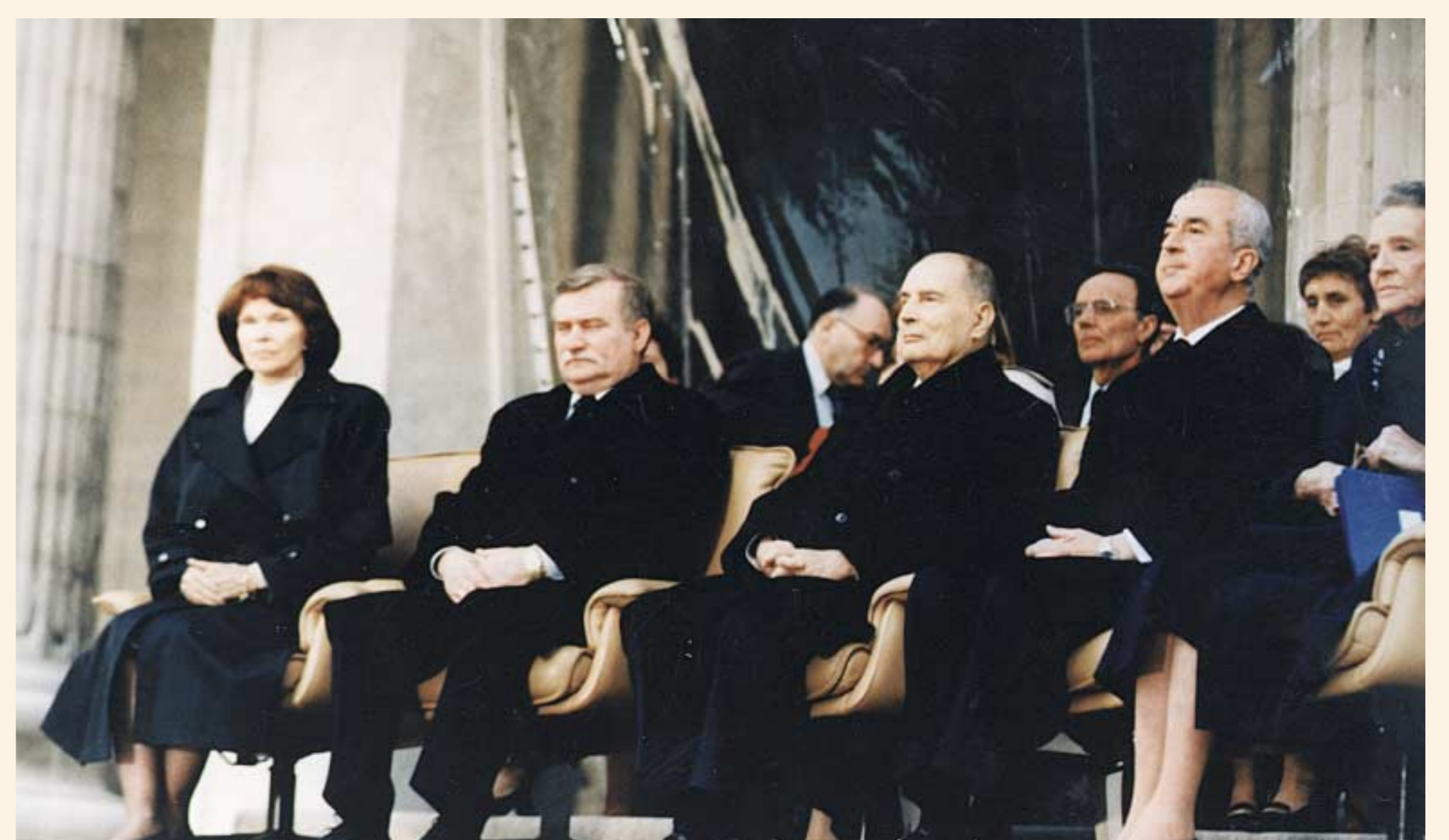
Presidents of the Republic of Poland and France during the celebrations