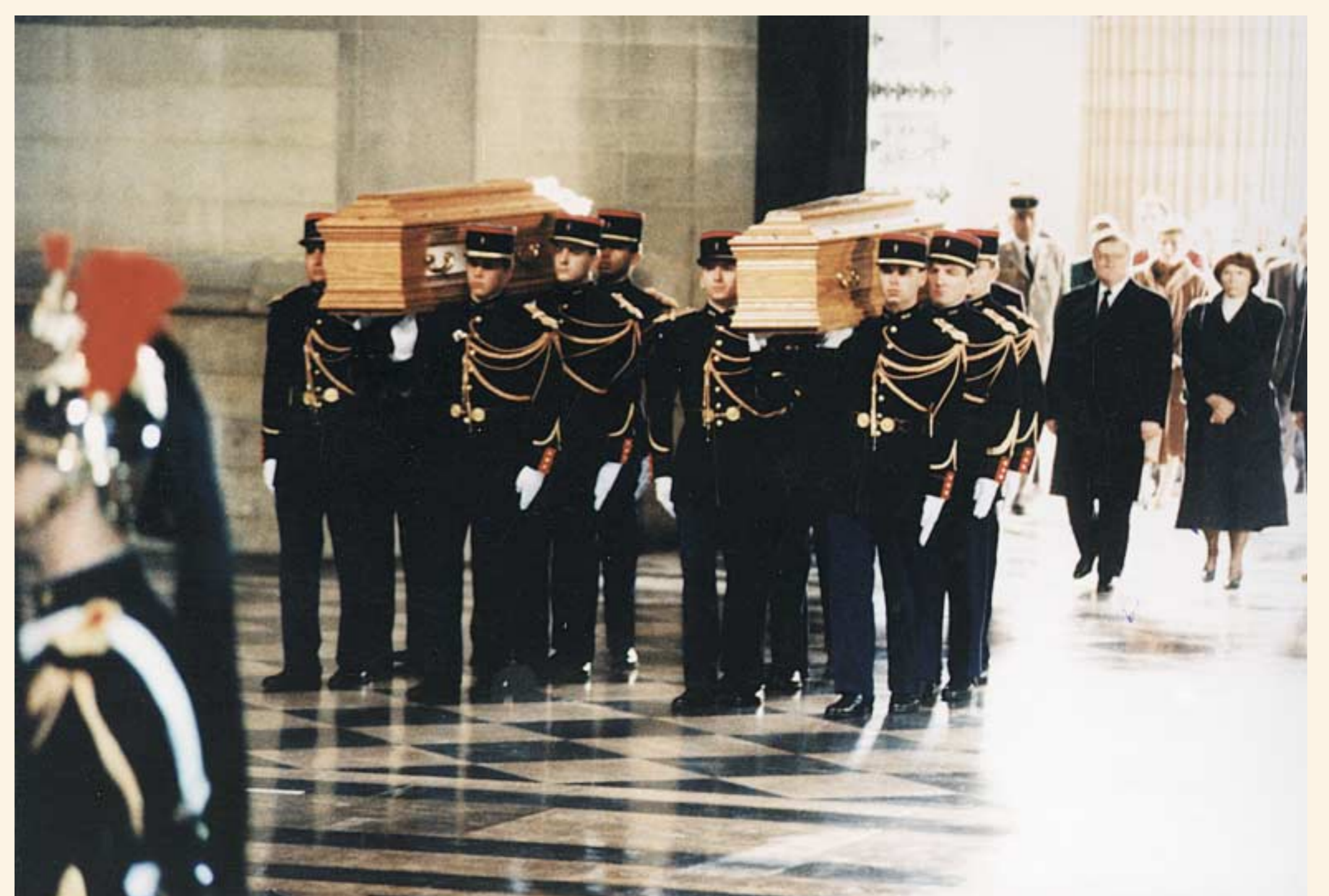
Coffins being brought to the Pantheon.