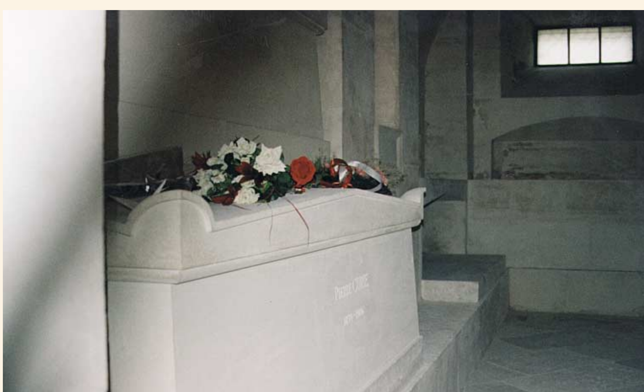
Crypt's of the scientists