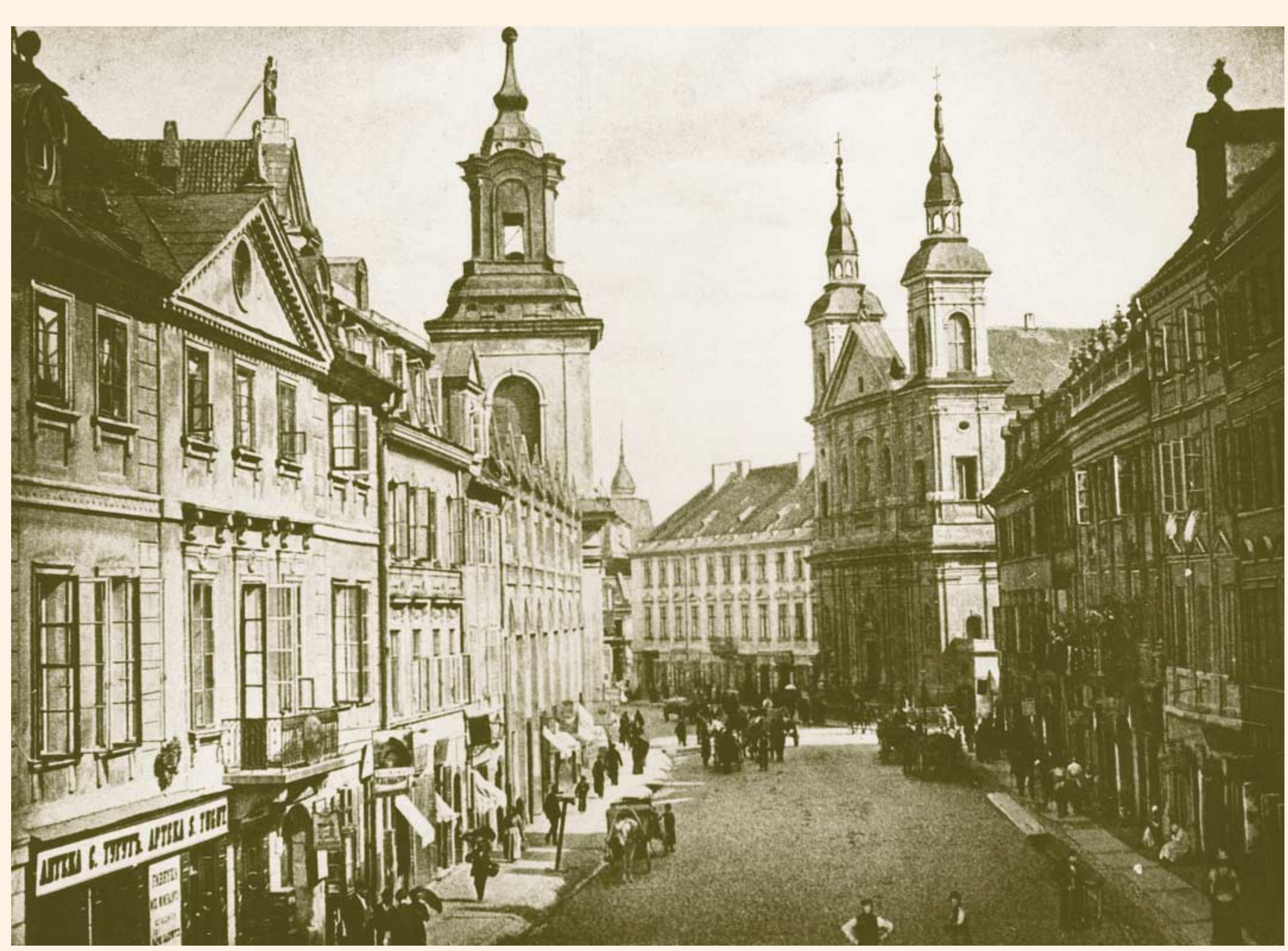
Freta Street XIX c.