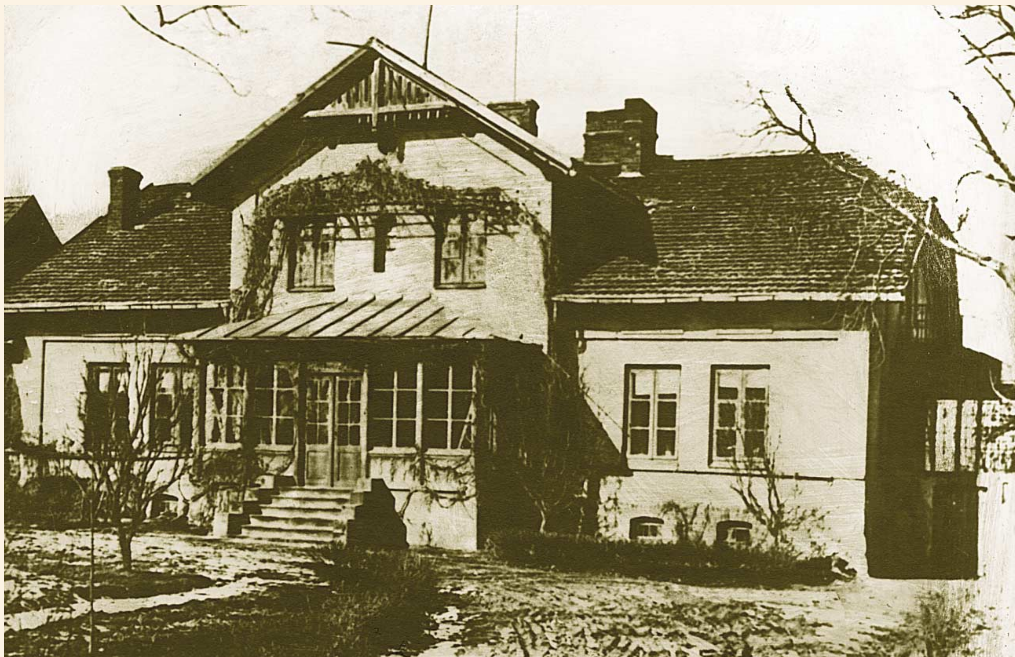
House of the Żorawski's in Szczuki where Maria worked as governess in 1886-1889