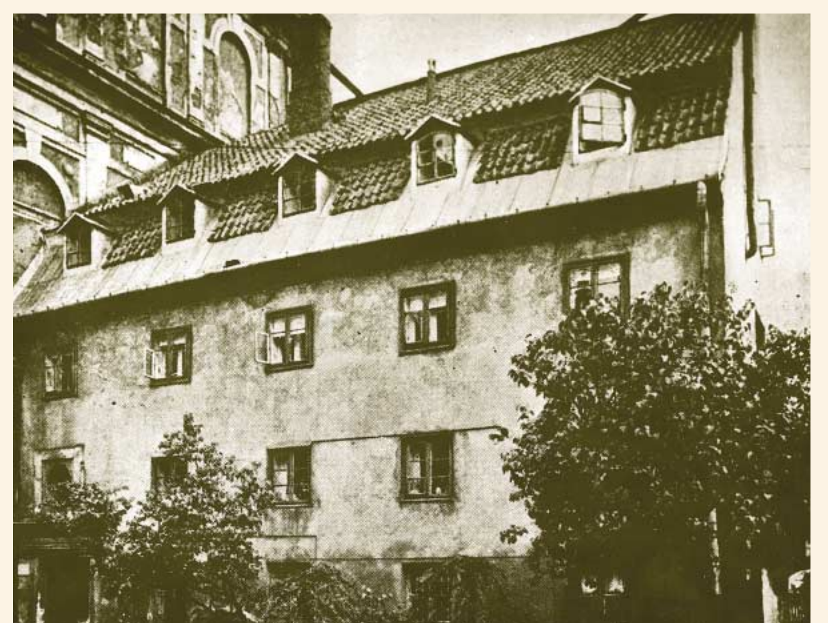
Annex which housed the chemical laboratory.