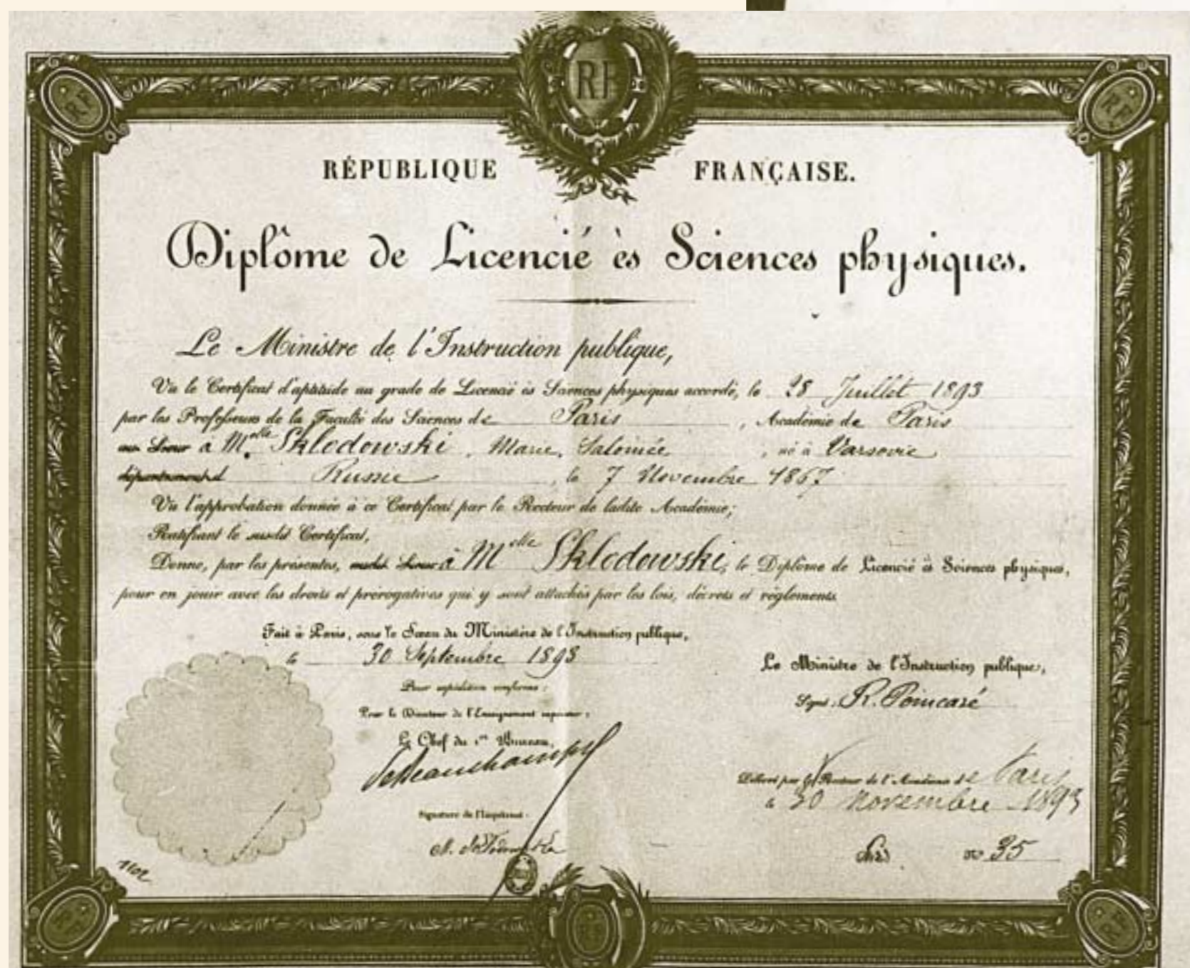
Licentiate in physics, 1893. In 1894 Maria received the licentiate in mathematics.

„Maria furnished this place with all the objects she possessed: an iron folding bed, the mattress she had brought from Poland, a stove, a white wooden table, a kitchen chair, a washbasin; a petroleum oil lamp, covered by a twopenny shade; a pitcher which she had to fill at the tap on the landing; an alcohol heater about as big as a saucer, which was to cook her meals for the next three years; two plates, a knife, a fork, a spoon, a cup, a stewpan; and finally a kettle and three glasses..”