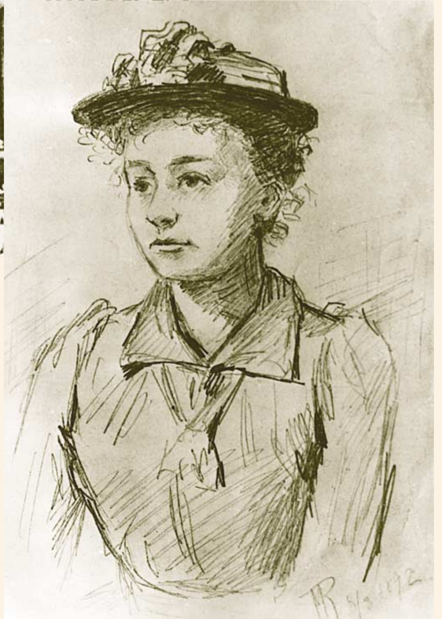
Maria's portrait drawn on a sheet of paper